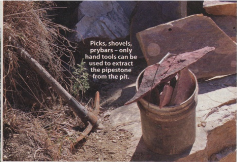
Picks, shovels, prybars – only hand tools can be used to extract the pipestone from the pit.

Thousands of years ago, countless hooves etched the prairie landscapes of western Minnesota with a network of migration and grazing routes that wore deep ruts into the grass-covered plains.